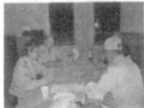
Of course, there was also the usual Pinochle game.