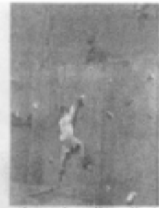
and a rock wall to climb.