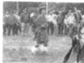
After the elections, the dance team members demonstrated some of what they have learned.