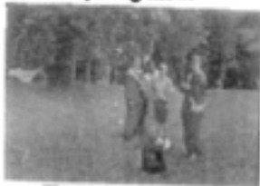
The team gets started.