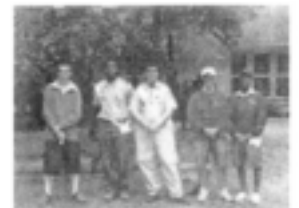
The new lodge officers for 2002-C