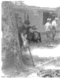
One other task was to move the large tent from the Staff site to the dining hall for use during summer camp.