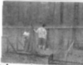
Saturday morning, before the rains, we managed to set up a number of the camps tents.