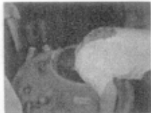
Friday night we had activities such as bobbing for apples..

This years fall fellowship found a new venue. The brothers gathered the FFA camp outside Smithfield for this years Fall Fellowship. Even though drizzle had been the standard weather through Friday morning, however the weather cleared just in time for the event. Friday night the brothers had fun with bobbing for apples, karaoke, putt-put and car bashing. Saturday was a series of training sessions and the Iron Duck relay which had a few different activities this year. Great Fall Fellowship and Great Fun.