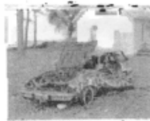
until the car was pretty much a mangled mess.