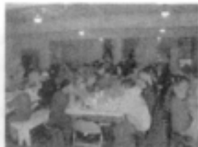
Saturday began with breakfast and