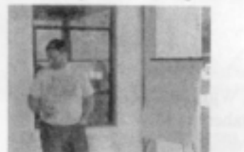
Elangomats and regalia.