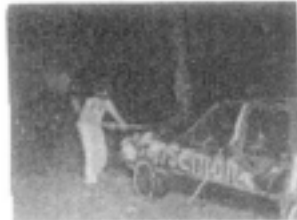
with everyone putting as much damage...