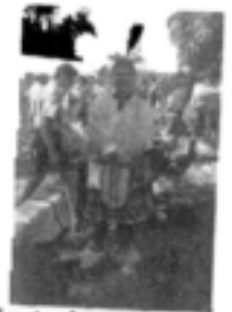
and not only made a showing