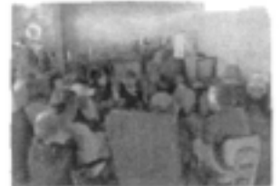
There was indoor sports?