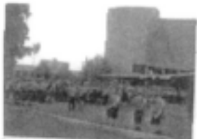
As the sun went down, we gathered for the opening show