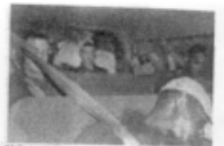
It didn't take long for some to try and get some sleep 'banked up' before arriving.