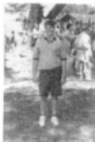
the art that they are trying to learn