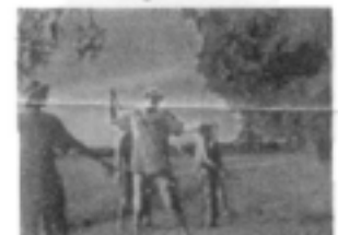
which included tomahawk throw