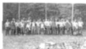
A sampling of the 26 members who received brotherhood membership during the weekend.