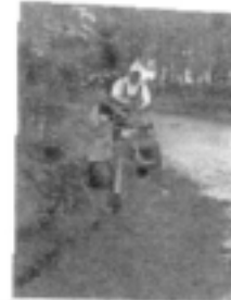
One of the jobs for the weekend, was digging a trench for a new phone line, unfortunately the rains later in the morning made the job impossible.