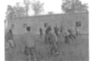
A little game of touch