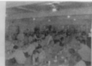
After the events of the day, everyone enjoyed dinner.