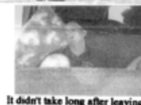
It didn't take long after leaving for home that the ducks were out.