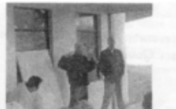
was followed by several training sessions