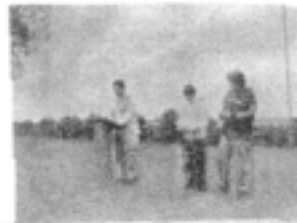
Sunday morning we had a chapel service followed by a Lodge meeting and home.