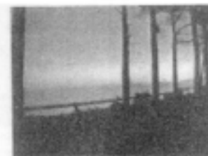
With the rain we had on Thursday and Friday, Saturday morning sunrise promised good weather.