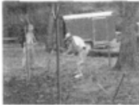
Even some of the adults gave a hand in setting the stakes.