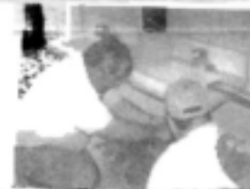
We even got some important plumbing repairs taken care of.