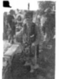
they also learned more about