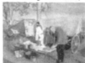
Saturday's lunch was provided by Tasty Critters