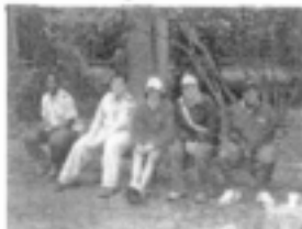
Saturday afternoon, the candidates for lodge office had the opportunity to answer any questions that the brothers might have had.