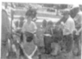
Our ceremonies team got checked in for their evaluation.