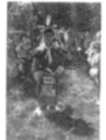
Our dancers also made a show