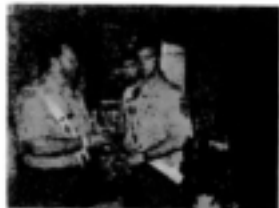
A few of our 63 New Ordeal members