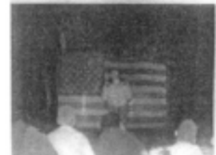
Followed by a campfire ceremony