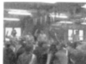
Sunday morning, the new officers were inducted into their offices.