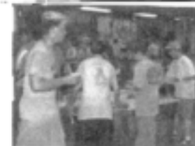
Friday night, after the Pre-Ordeal Ceremony, the brothers gathered for some fellowship and food.