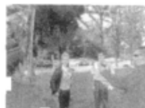
Saturday we were visited by Miss Teen Isle of Wight