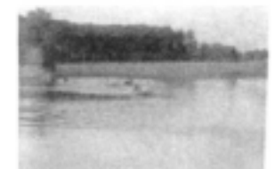
The Iron Duck relay competitio