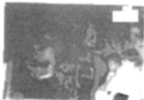
We all got into the cheers as we waited for everyone to get into the auditorium for the opening show.