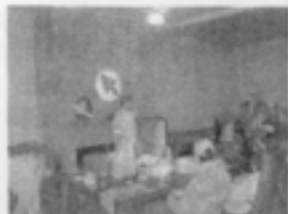
that the brothers could attend. There was training about Service,