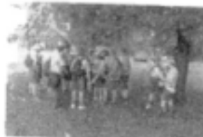
We're here, so this is what's up