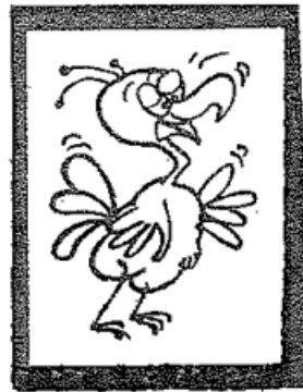
QUACKS FROM THE EDITOR

This year we are trying a new approach to our newsletters. They will be printed six times a year, once every two months. Also, a new printing process is being incorporated along with a new layout design. I hope this will make the newsletter more enjoyable for you to read.