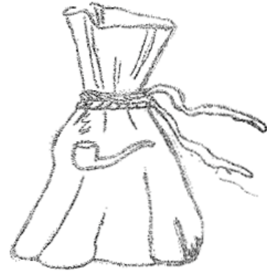
FROM THE MEDICINE BAG

I would like to thank the lodge for electing me to the office of Chief for this year. I would also like to congratulate all others who were elected to offices.