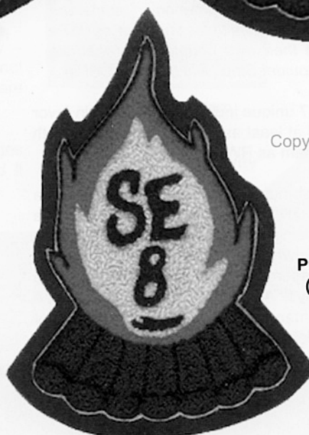
Prototype 3 (Figure 4)