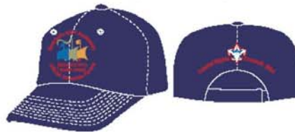
Hat (Color: Kahki)