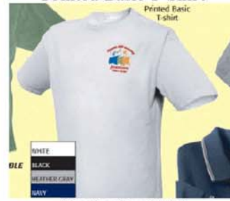
Printed Basic T-Shirt